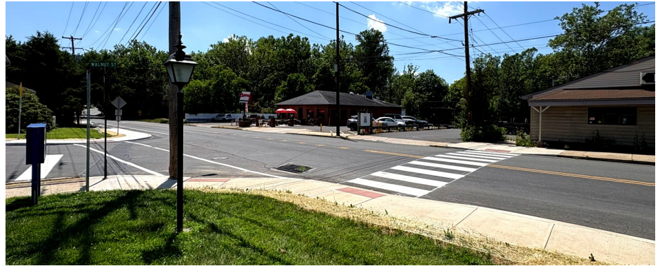
Newly installed sidewalk and crosswalk link PA Highlands Trail to Perkiomen Trail through Green Lane.

The PHTN Steering Committee many years ago identified Green Lane as key to completing the trail network that winds through 13 counties, over three rivers, connecting the towns of Easton, Bethlehem, Quakertown, Green Lane, Phoenixville and Pottstown. As it heads west, it meanders through six state parks and